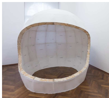
The Helmet, Wood, plywood, fabrics, acrylic paint, 200 x 200 x 200 cm, 2016. Courtesy Gandy gallery