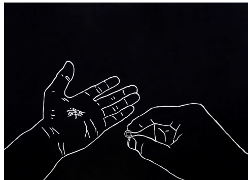
The Traveller, Acrylique and oil on canvas, 120 x 87 cm, 2015.