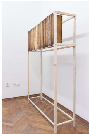
The library of the day, Wood, bee wax, 170 x 190 x 50 cm, 2016.