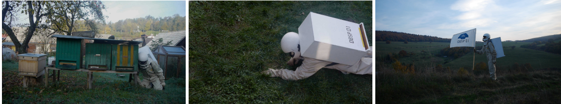
Mirror Land, movie still, HD video, 2016.

Opening: Tuesday, March 15, 2016, 6 – 8pm Exhibition: March 16 - May 13, 2016