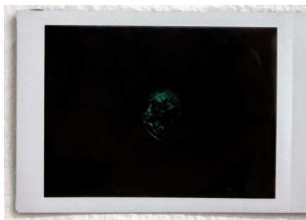
From The Earth to Mirror Land, 5 Polaroid Photos, 57 x 12 cm, 2014.