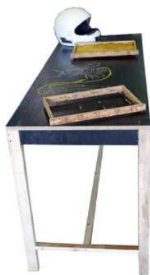
Beekeeper's table, Wood, plywood, acrylics, 160 x 100 x 80 cm, 2016.