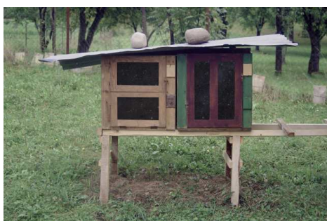
Every beehive is a Universe, C-Print, 40 x 27 cm, 2016.