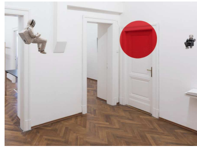
Cosmonaut (distant lands), 2 glazed ceramic figures, 25 x 15 x 15 cm, 2016.