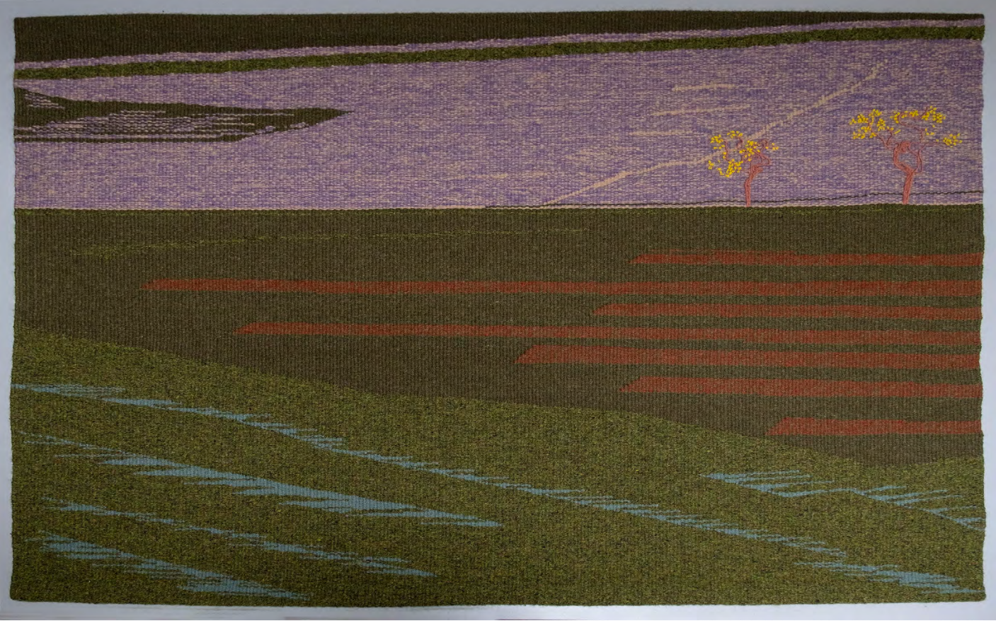
ZORKA SÁGLOVÁ Landscape III, 1979 Tapestry, 97 x 137 cm

ANNA DAUČÍKOVÁ, DENISA LEHOCKÁ, ZORKA SÁGLOVÁ, JANA ŽELIBSKÁ Artissima Torino 2018 (Booth n° 9, Light blue) 1 - 4 November 2018