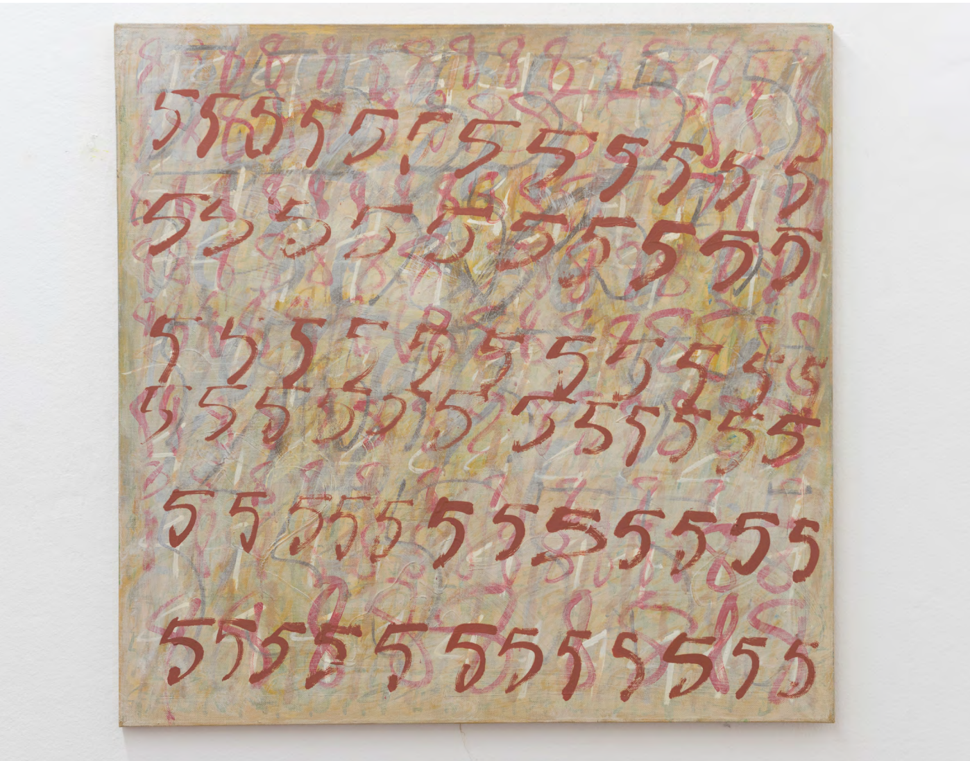
ANNA DAUČÍKOVÁ Fives (puzuola) , 1993 Oil on canvas, 95 x 97 cm