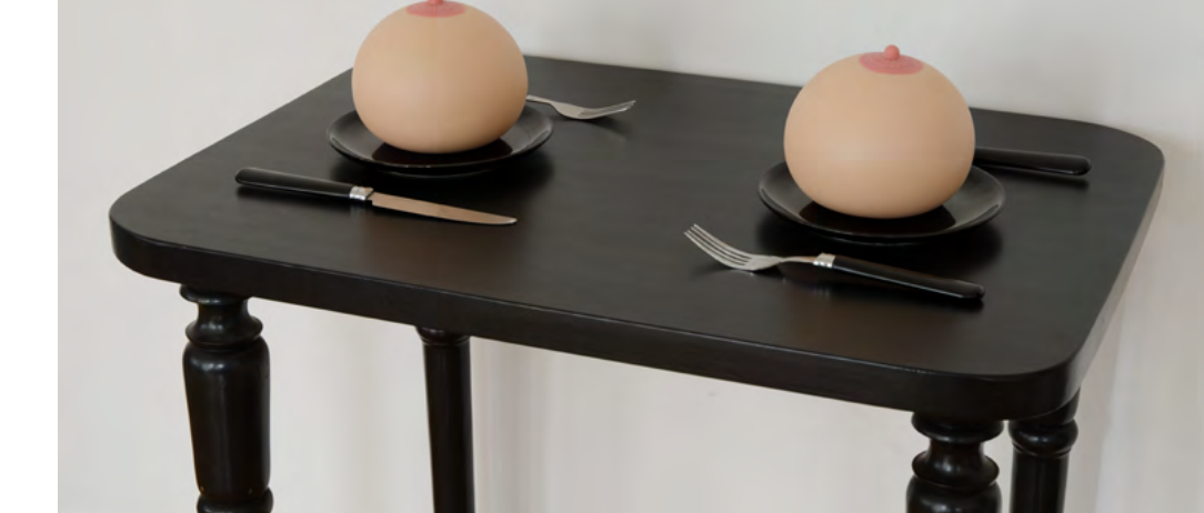
JANA ŽELIBSKÁ Pudding for Two, 2016 Installation, mixed media Courtesy Gandy gallery