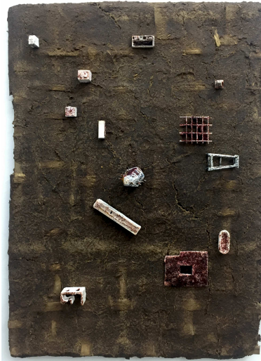
Imaginary Cities VI, 2017 Mixed media on cow dung panel, 58 x 41 cm

“Civilization is built on an aqueous foundation. A world that is in a constant flux, a culture continually in ebb and flow.” Bijoy Jain