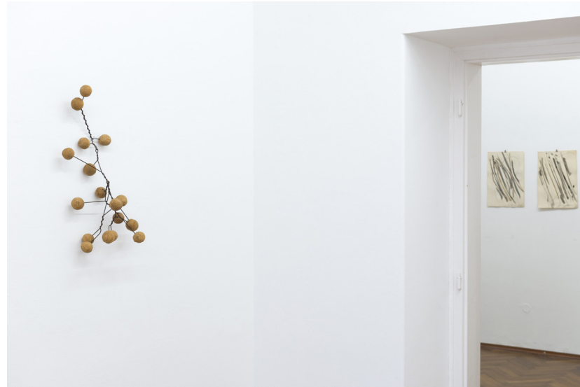
S. T., 1963/1966 Object (iron wire, wood), Variable dimensions (from 50 x 50 x 30 to 100 x 70 x 30 cm)