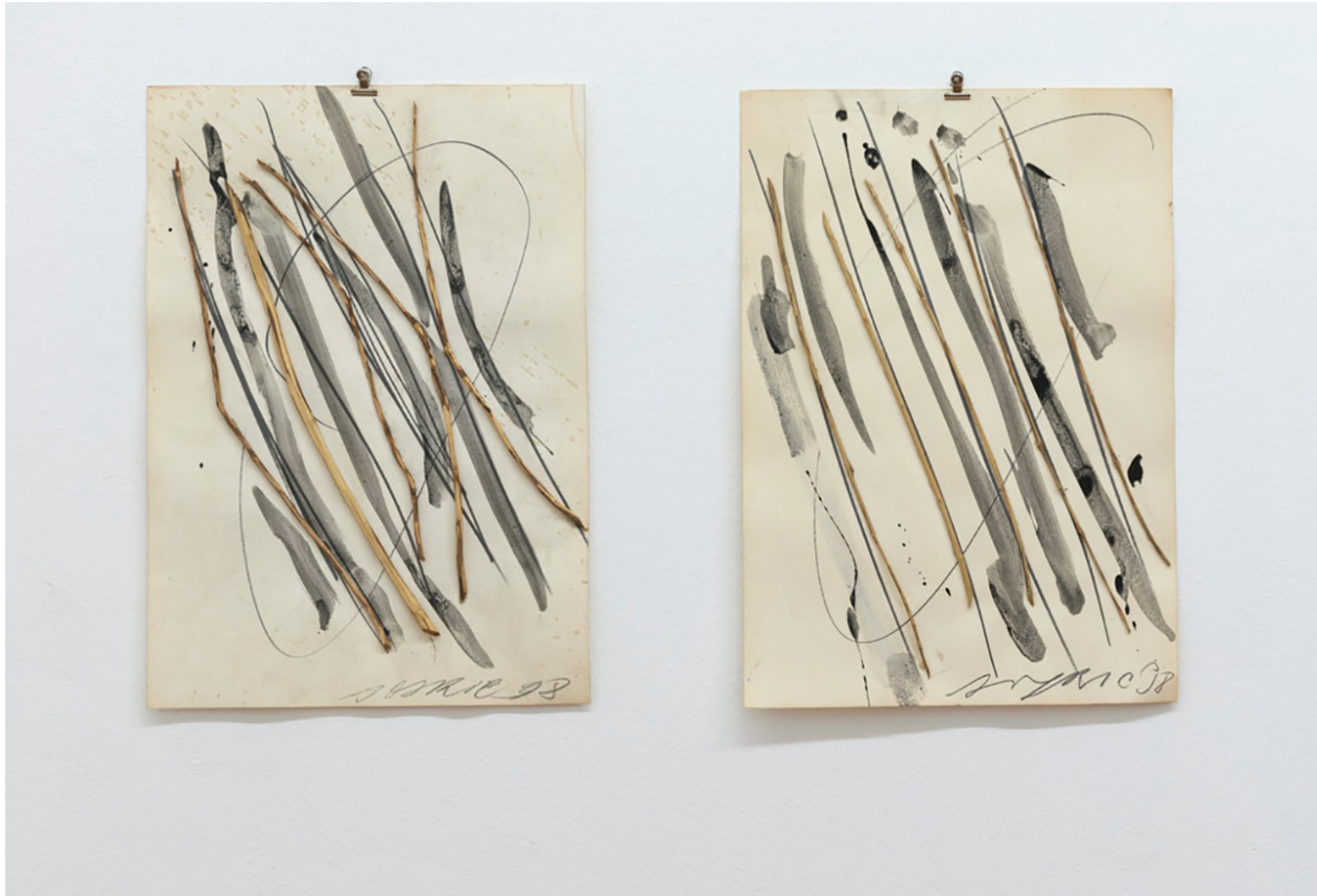
Parallele I., 1998

Drawing/Installation on paper (wood, paper, ink), 50 x 36 x 2 cm