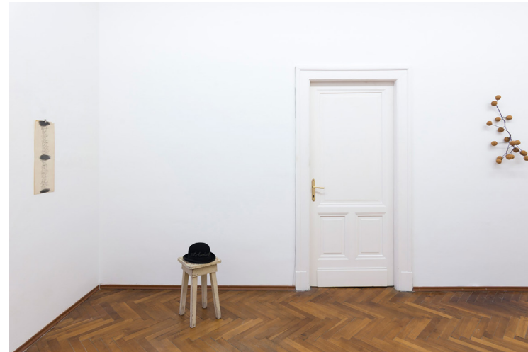
Entscheidungsproblem, 1997 Object, 30 x 25 x 13 cm