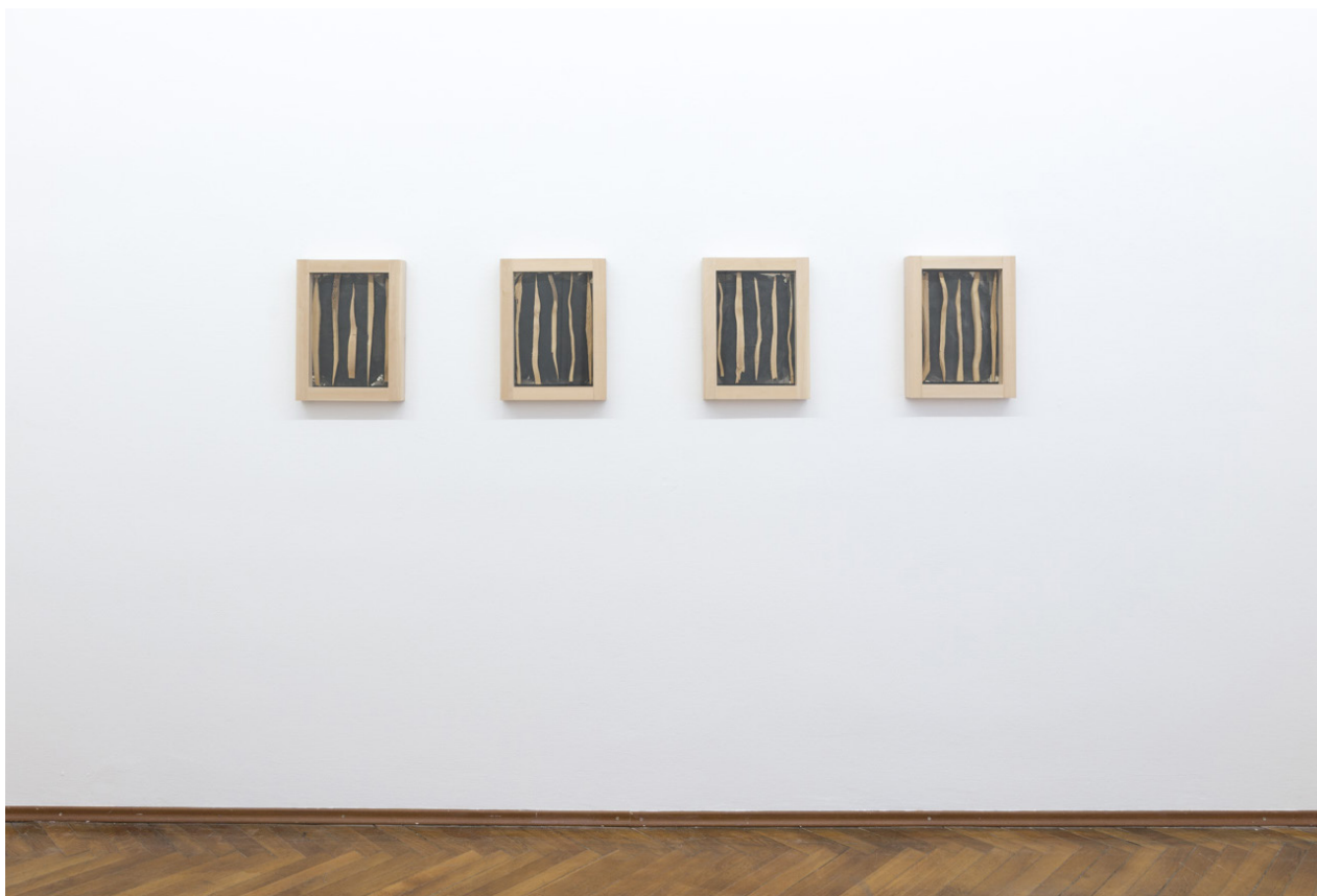
Parallele I. - IV., 1999

4 pieces, Installation on paper (wood, paper, ink), 50 x