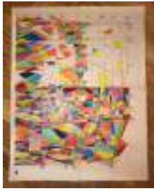
Untitled, 2020 Drawing 45x62 cm Courtesy the artist and Gandy gallery