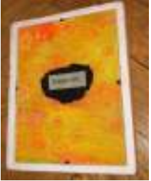
Happy life, 2020 Paper, cloth, collage 10x15