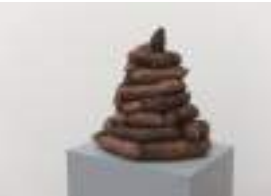
Bunch of shit, 2019 Object, papier-maché 29x30 cm