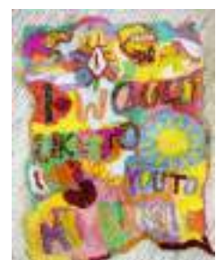
I would like to introduce you to my burnout, 2019/2020 Embroidery 52x40 cm