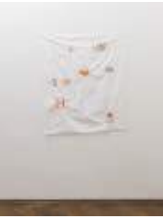
Untitled, 2020 Embroidery 118x86,5 cm Courtesy the artist and Gandy gallery