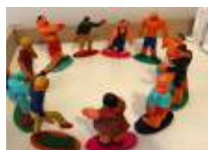
Happy Shiny people, 2019/2020 Object, papier-mâché 11 pieces Courtesy the artist and Gandy gallery