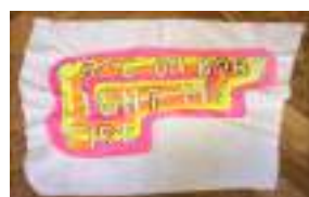
Come on baby, light my fire, 2020 Embroidery 37x41 cm