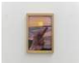
Untitled, 2019 Photo 23x28 cm