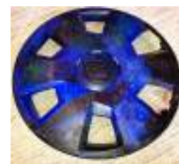
Untitled, 2019 Object 41 cm