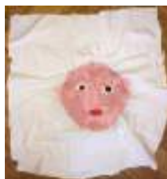
Albita, 2020 Embroidery 42x38 cm