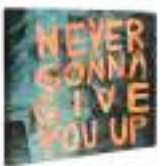
Never gonna give you up, 2019 Object, paper, collage 20,5x20,5 cm