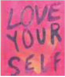
Love yourself, 2020 Object, paper, collage 20,5x17 cm