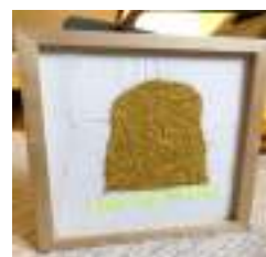
Find the needle, 2020 Embroidery 23x28 cm