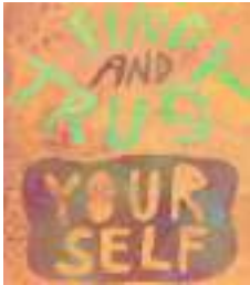
Find and trust, 2020 Object, paper, collage 33x25,5 cm Courtesy the artist and Gandy gallery