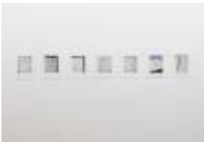
Untitled, 2010/2012 Photo 30x40 cm, 7 pieces