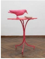
Pink Bird, 2021 object, wood, stone, plastic, steel, 80x48x38 cm