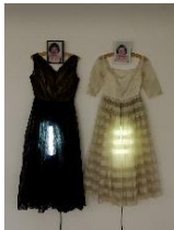
Dress, 1995 object, textile, light 163x163 cm