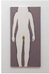
She C-19, 2020 mixed media, 140 x 70 cm