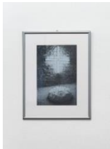
Eternal cycle, 1990 serigraphy, 61x41cm (size without frame) Courtesy of the artist and Gandy gallery