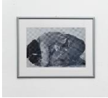
Cash on delivery, 1978 serigraphy, 46x68 cm