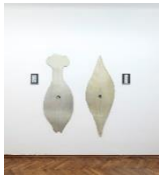
Sections, 1990 metal object, 190 x 183 cm