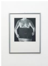
Anti-aesthetics, 1978 serigraphy, 52x47 cm (size without frame) Courtesy of the artist and Gandy gallery