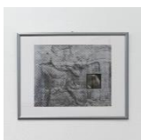
Memories, 1984 serigraphy, 49x63 cm (size without frame)