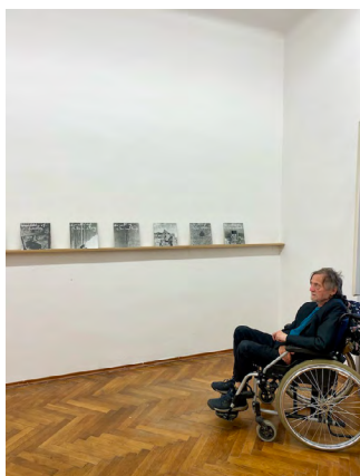
Jiří Valoch, Dream , 1974, b-w vintage photography (series of 3), 18x13 cm, unsigned, published in Jiří Valoch's first monography, Poesia visiva, Roma, 1974 Exhibition 05/07/2022 Gandy Gallery.

The donation to the Moravian Gallery in Brno and the creation of the permanent exhibition «ART IS HERE: New Art after 1945» contributed significantly to the establishment of conceptualism and new forms of art in the context of Czech museum and gallery institutions.