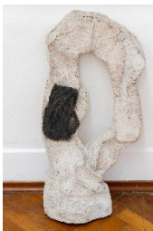
Alva Hajn, Untitled, 1980s Concrete, 75 x 36 cm