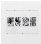
Karel Adamus, Hold šlěpějím, 1973/2023 4 x b-w photography, 10x15 cm each