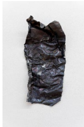
Miloš Šejn, With stone on stone, since 1983 lead, cca 26x60x15 cm