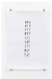
Dušan Urbaník, Velká přestávka III, 2005 Ink on paper size 59x84 cm