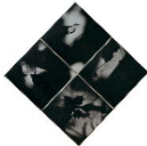
Houdini, 1990 B/w photographs, fabric 120x120 cm signed, dated, titled Estate Birgit Jürgenssen (ph735)