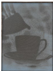
Untitled, c. 1988 Color photograph, fabric 40 x 30 cm Estate Birgit Jürgenssen (ph754)